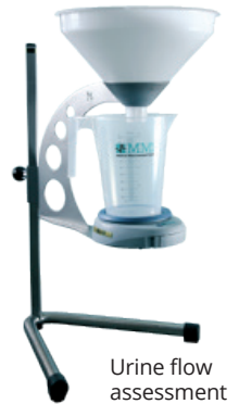
Urine flow assessment

Your doctor will discuss treatment options suitable for you.